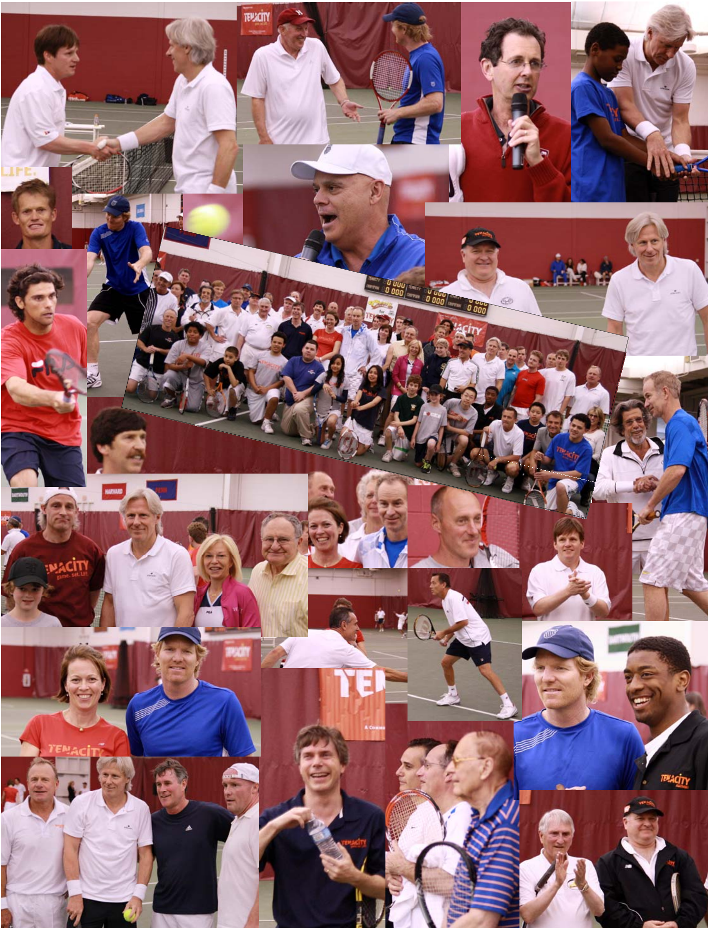
Tenacity Pro-Am Fundraiser