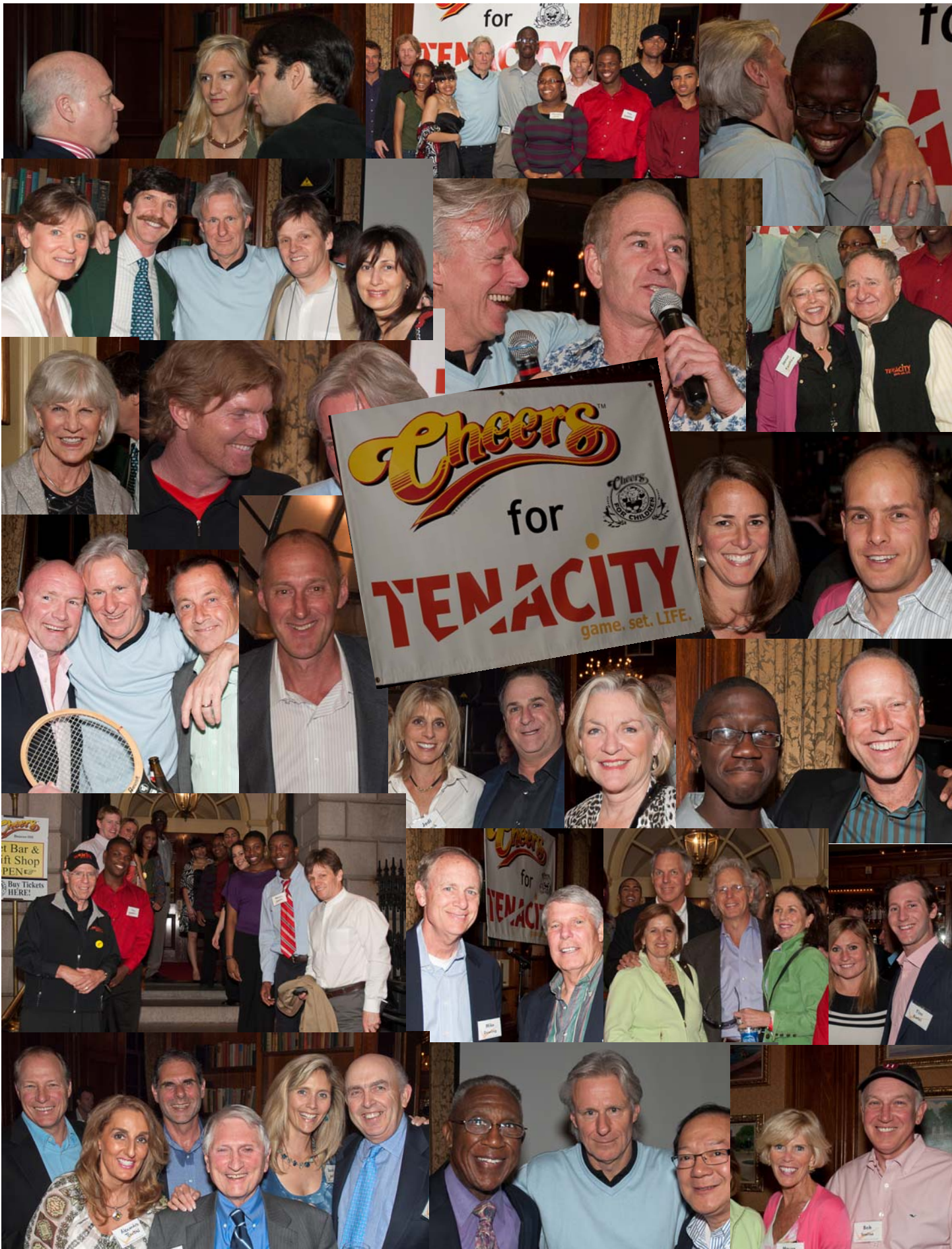
Tenacity Cheers-Hampshire House Party featuring Staples Champions Cup Players